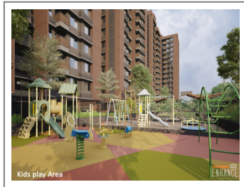
Kids play Area