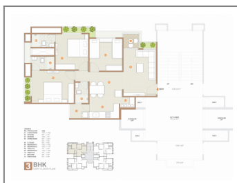
9th to 10th Floor

Note : All visuals, images, facilities and other details shown here are for presentation only and are subject to change by the builder/developer/owner without any obligation.