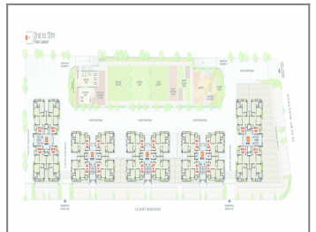
Third to 5th Floor