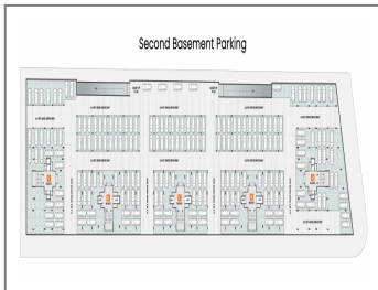
Second Basement Parking