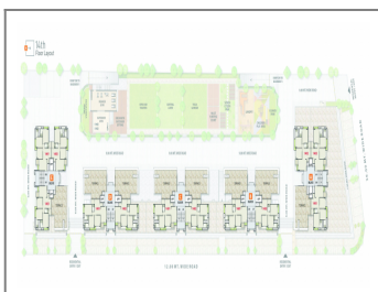
6th to 8th Floor