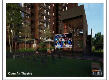
Open Air Theatre