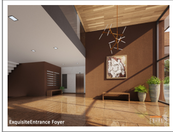
Exquisite Entrance Foyer