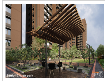
Senior Citizen park